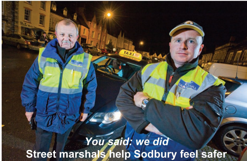
You said: we did Street marshals help Sodbury feel safer

You can let us know what you think by visiting our website, www.avonandsomerset.police.uk/newsletters